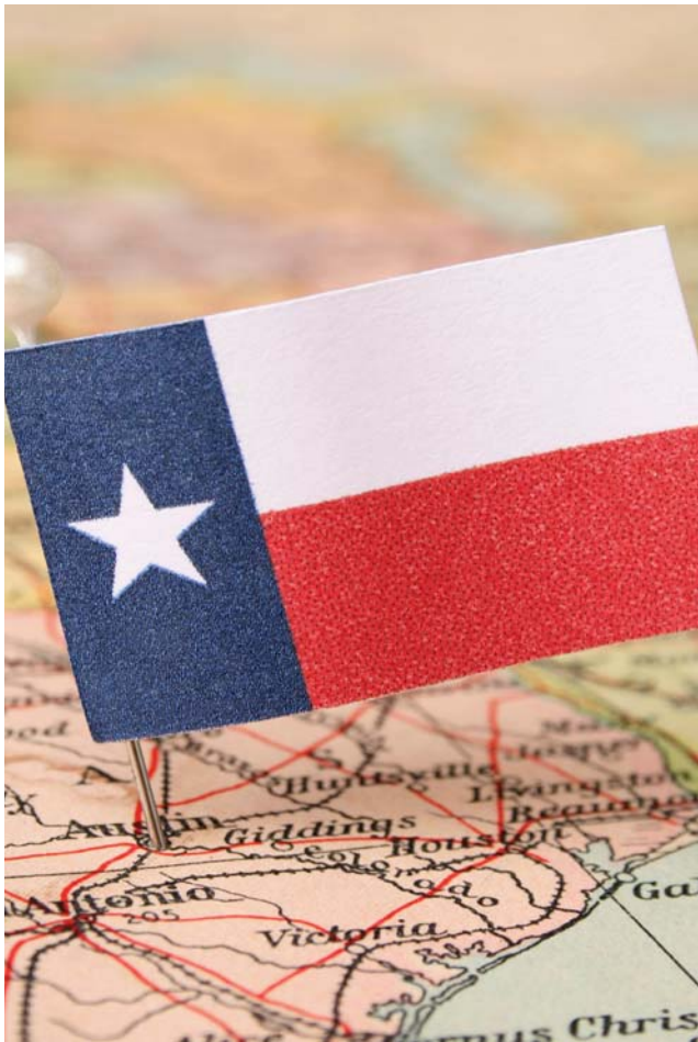
SIDEBAR LEFT HEADLINE

The combination of Texas’ economic conditions, geographical location, natural resources, infrastructure, political conditions and even the weather have created a perfect storm of opportunity and growth that is greatly outpacing the rest of the nation. Even in a time of national recession Texas holds strong and continues to be the fastest growing state in the nation. Because of such stability and growth businesses and individuals are flocking to Texas. Of the 24 million people living in Texas 4 out of 5 live within a the triangular region made up of Dallas/Fort Worth, Houston, San Antonio and Austin... we call it the Texaplex. By the year 2030 forecasts show that we will add an additional 14 million people to the Texaplex. That’s the equivalent of adding another Dallas / Fort Worth, Houston, and Austin... all within the Texaplex!